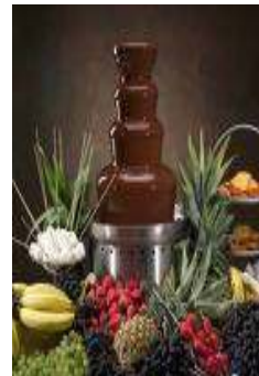
Table Sprinkles to compliment theme and colour scheme